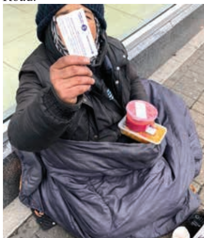
Street food: A grateful recipient

the Martin School kitchens and meals are available to anyone every Tuesday morning from 10.30am to 12.30pm at the Phoenix Cinema in the High Road.