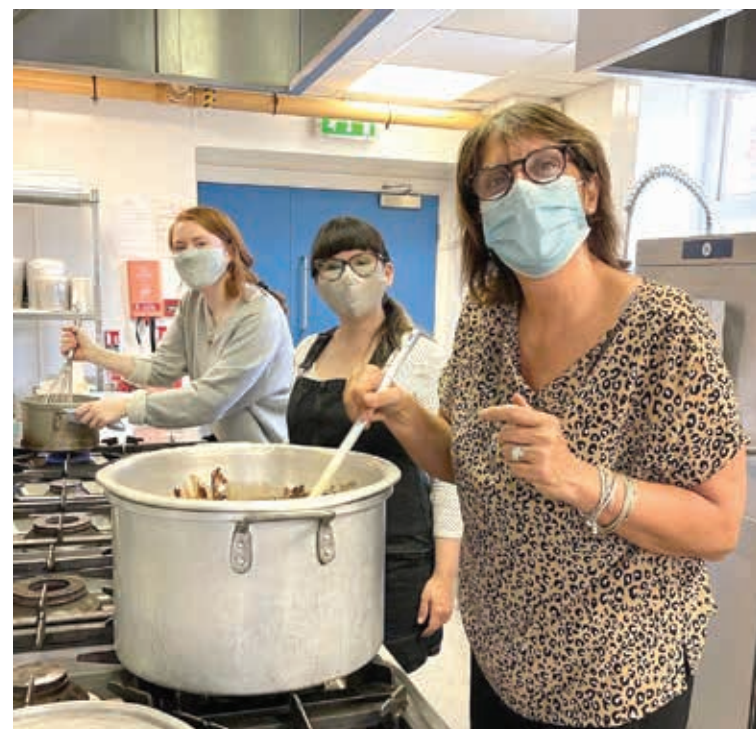
Stir it up: The weekend kitchen team get busy