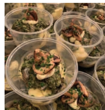
Portions: Restaurant quality