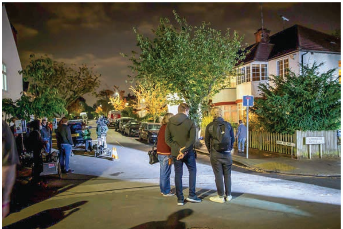
Quiet, please: The cameras roll during filming for The Beautiful Game in Cherry Tree Road.

If you have any comments, thoughts or ideas about a happy to chat bench (or can think of another name) please email them to eastfinchleycommunitytrust@gmail.com and/or send them to The Archer's Letters page (contact details on page 2).