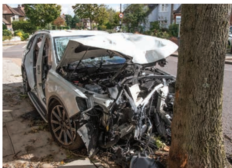
Impact: The driver emerged with non life-threatening injuries from this collision in Twyford Avenue.

"Leaving the road is obviously very serious at any time, but if that tree hadn't stopped the car it would have run along a normally busy bit of pavement that leads to the cut through by the church onto Durham Road," said a resident who lives close by. Police