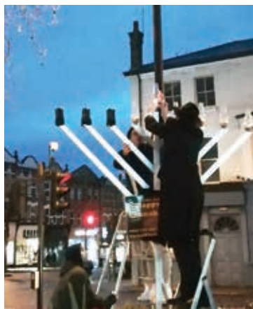
The menorah is prepared for lighting

After missing out thanks to the isolation rules last year, the East Finchley community will once again be able to come together for two festive lighting ceremonies early next month. The Christmas tree outside Budgens in the High Road will be lit up on Saturday 4 December at 5pm. Everyone is welcome to come along to enjoy seasonal music and carols from The London Metropolitan