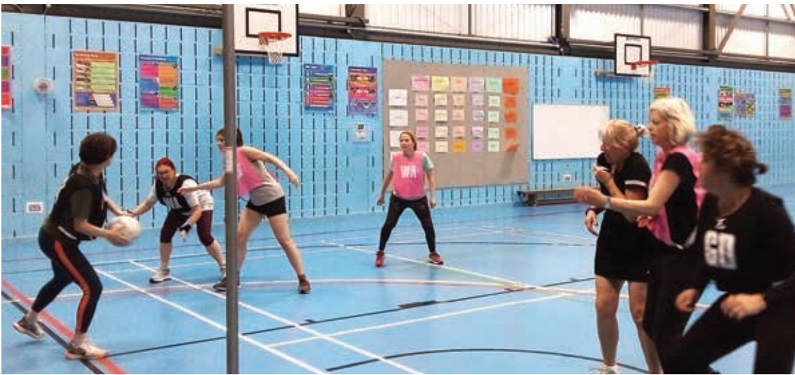
Court action: Players enjoy a match in the sports hall at the Archer Academy.