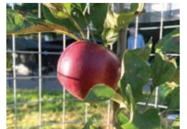
Core Blimey: A Cherry Tree Wood apple

The crunchy red apple we tried is called the Core Blimey. Bred to be strong, resilient and suited to London clay it does not suffer from any of the problems associated with the traditional Cox. We are looking forward to another good crop next year when in October 2022 we will hold our