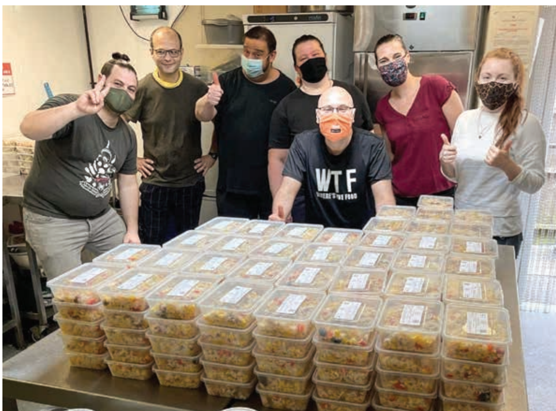
Ready meals: Two hundred servings are packed, sealed and labelled, ready for distribution

the Martin School kitchens and meals are available to anyone every Tuesday morning from 10.30am to 12.30pm at the Phoenix Cinema in the High Road.