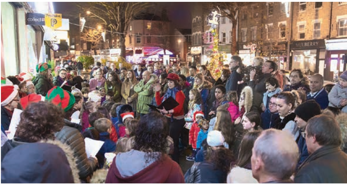
Festive gathering: The crowd sings carols at the last Christmas lights ceremony in 2019