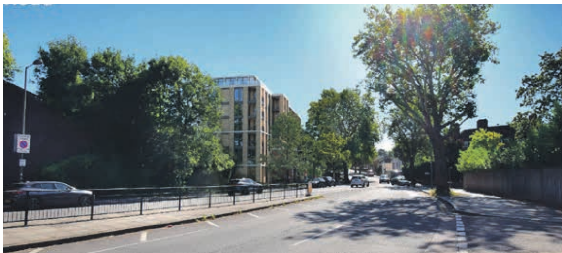
New build: An artist's impression of how the development, centre, would look, looking south past The Bishops Avenue on the right.