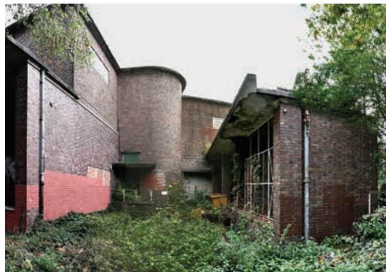
As it is now: The development would replace a derelict substation site alongside the Northern line.

For more information and to give your feedback on the proposed development, visit Barnet Council's planning site at publicaccess.barnet.gov.uk/ online-applications and search for application 21/5217/FUL.