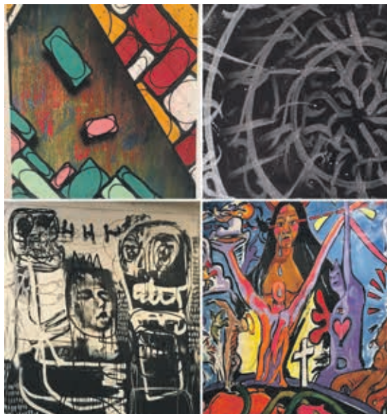
The Externals: Some of the works on display in the pop-up gallery at 42 High Road.

Visitors to the gallery will be encouraged to get creative and add to a community doodle, which will be displayed publicly when finished.