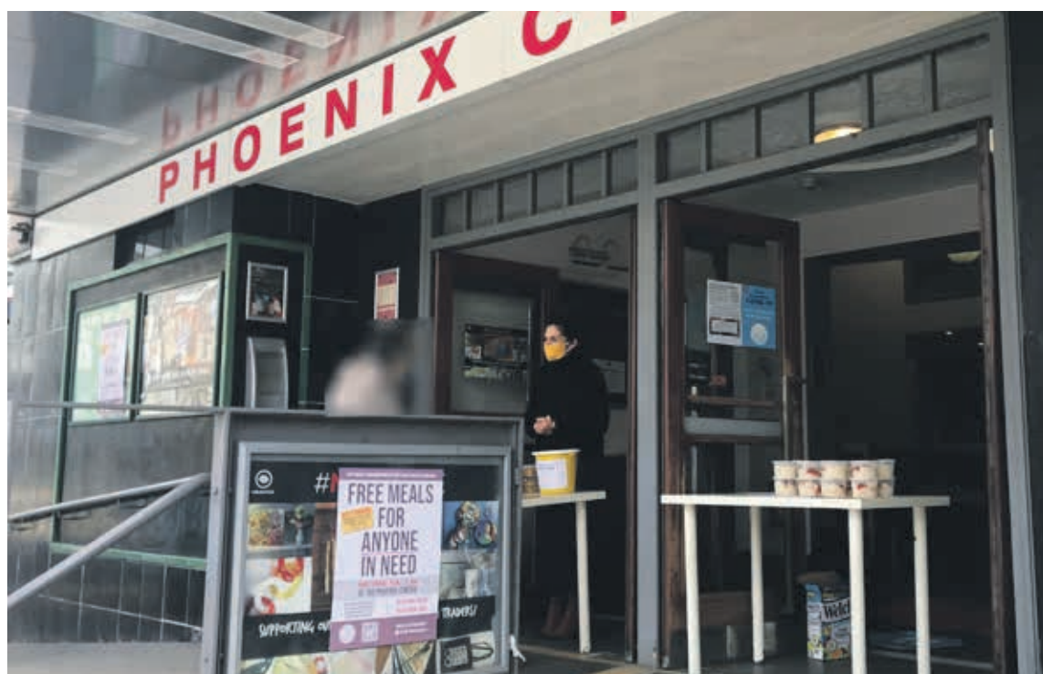
Table service: Free meals are handed out from the Phoenix Cinema foyer on Tuesday mornings