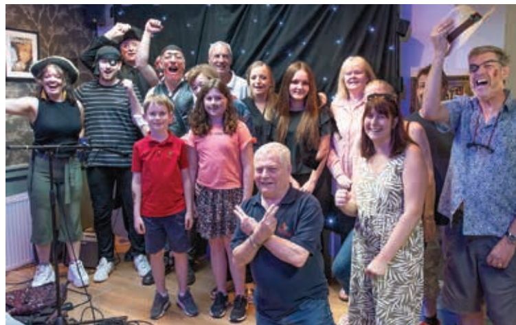
Motley crew: The band of pirates helping to raise funds in Madden's.