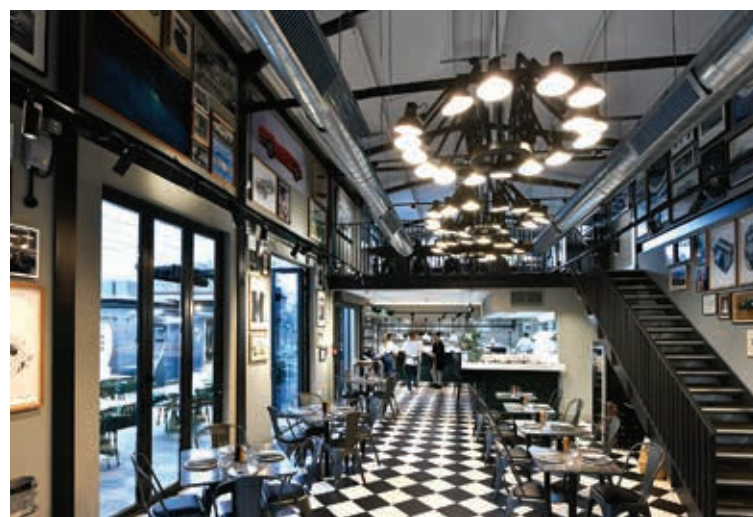
Top gear: Kitchen and serving staff in the Engine Rooms dining space.

The best way to find out what's there is to go and take a look. You could get yourself a freshly squeezed orange juice at the same time. Cherry Tree is open daily from 7am -9pm.