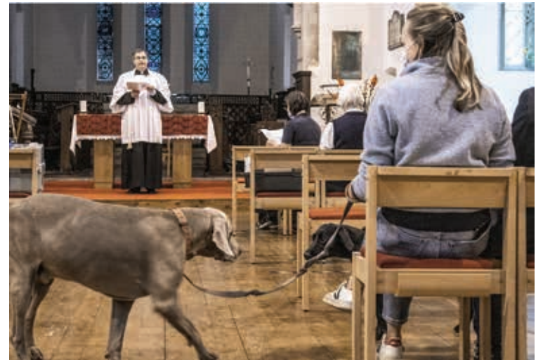
Pet blessing: Two dogs make friends during the service at Holy Trinity Church.

The reading, from the Book of Genesis, told of the creation of animals to accompany man: "It is not good that the man should be alone; I will make him a helper as his partner." Hymn 662 sang about the integral part animals play in our lives. One member of the congregation,