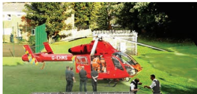
Landing zone: The Air Ambulance uses the play area