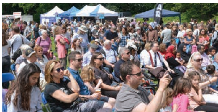
Highlight of the summer: East Finchley Festival

This will be the first time in the festival's almost 50-year