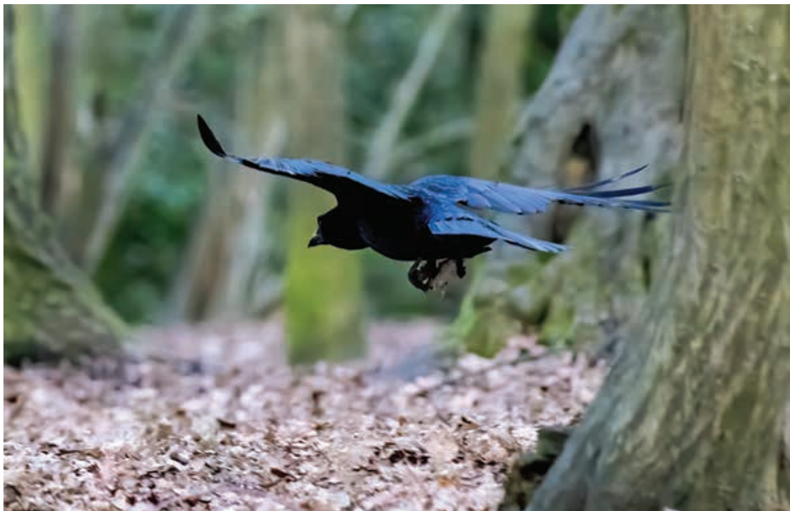
Landing gear: A crow comes descends onto the woodland floor