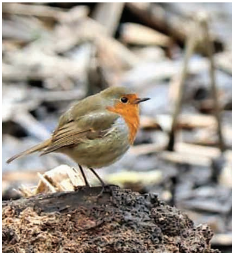
Garden favourite: A robin explores Coldfall Wood