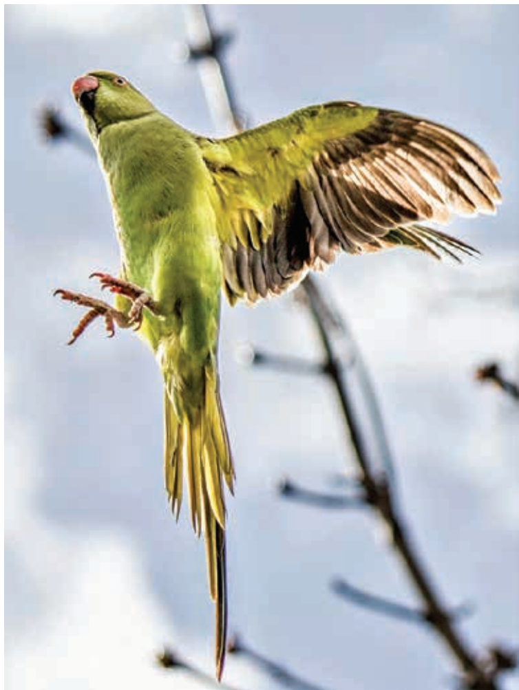
Green wing: A parakeet makes a spectacular sight