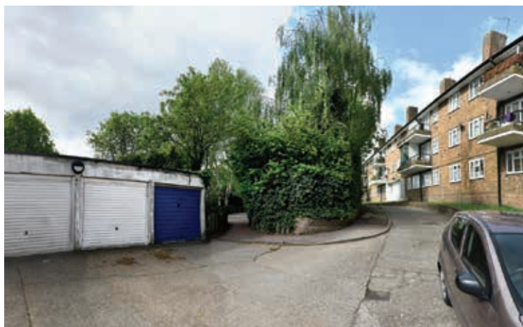
Going: A row of garages are also earmarked for demolition.

The proposals can be viewed in full at www.givemyview.com/grangeestate . Alternatively ring 0800 644 6040 or email grangeestate@newmanfrancis.org