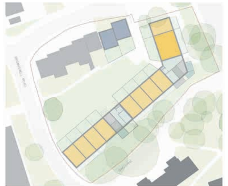
New build: A five-storey block will be built on land off Brownswell Road, currently occupied by three homes and a playing area. An existing oak tree will be protected and new trees planted.