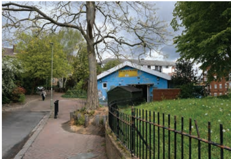
Going: The nursery building on Red Lion Hill will be demolished

At the time of going to press, 676 residents had signed a petition to save the Brownswell Green playing area and prevent the demolition of the homes. Resident Associations have been formed at both these sites to register their green spaces as community assets in order to protect them.