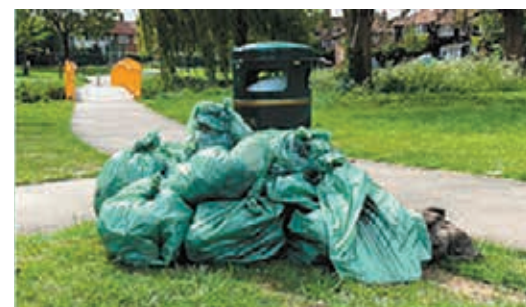
Bin it: Bags of litter collected in a Barnet park

Also from animals, presumably in the charge of humans, dog poo. Whilst many owners do pick up their dog waste, some then leave it in bags hanging from trees or fouling someone else's property. One resident with a garden fence backing onto Southern Road