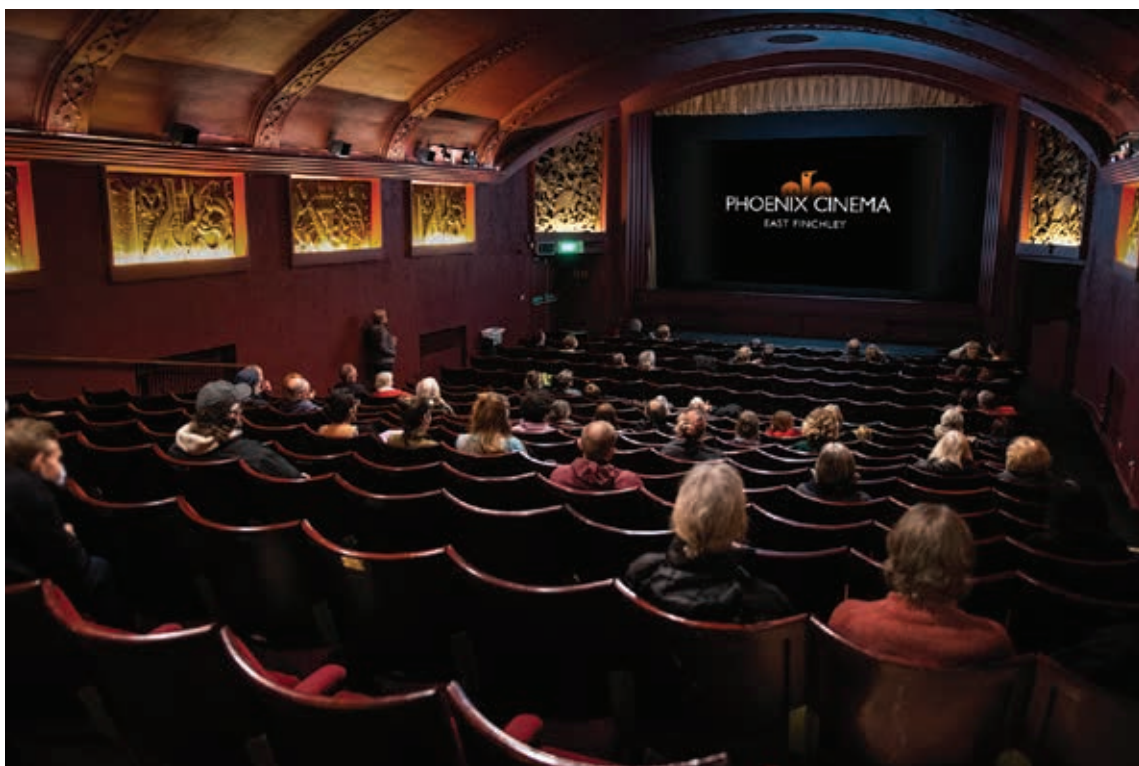
Take your seats: The audience settles in to the magnificent Phoenix auditorium on its first day of reopening.

A community newspaper for East Finchley run entirely by volunteers.