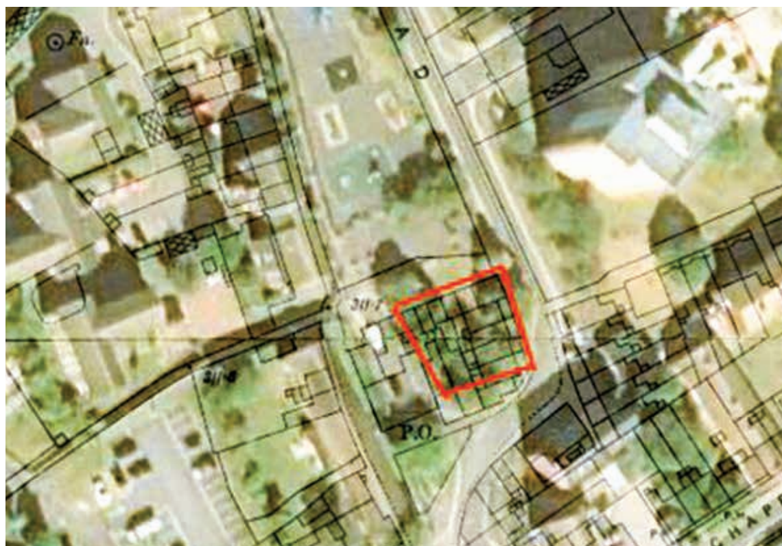
Ghosts of the past: Market Place as it is today, with the old street plan superimposed on top

On 15 November 1940 the area was heavily bombed during the Blitz. Many of the houses were destroyed.