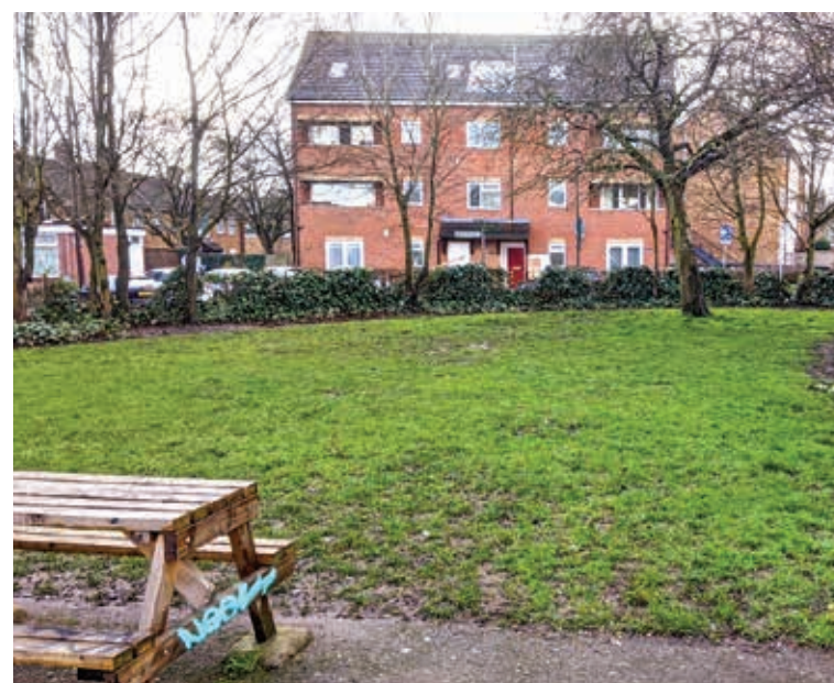
Above: Dig site: The spot in Market Place where the archaeological teams will be investigating this month.