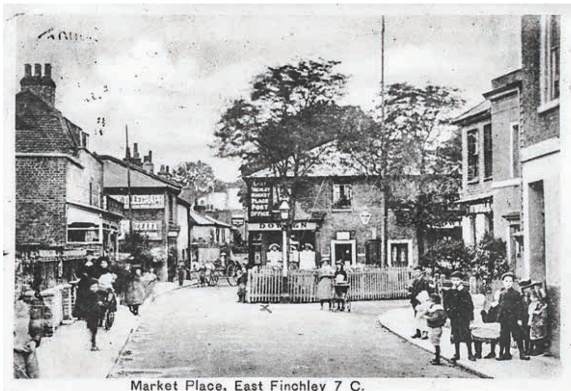
Market Place, East Finchley 7 C.