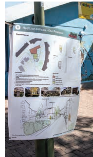
Redevelopment: A notice to Grange residents

In early May, NormanFrancis corrected its mailing list, which had inadvertently not included Brownswell Road or Tarling Road, and augmented their consultation methods. Three Zoom surgeries were