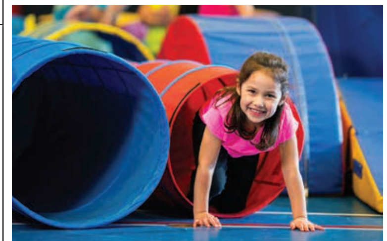
Still active: Gym classes are running at LAGAD this year