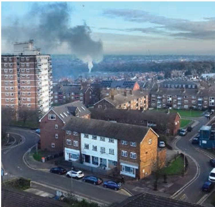
Smoke signals: A photo taken from Prospect Ring shows an allotment bonfire burning

anonymous, urged allotment holders to have more consideration for the potential smoke and particulate pollution they could be causing by burning waste so close to homes and the neighbouring Martin Primary School.