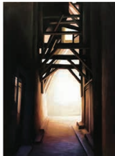
Light and shade: Christine Watson's pastels are on show online