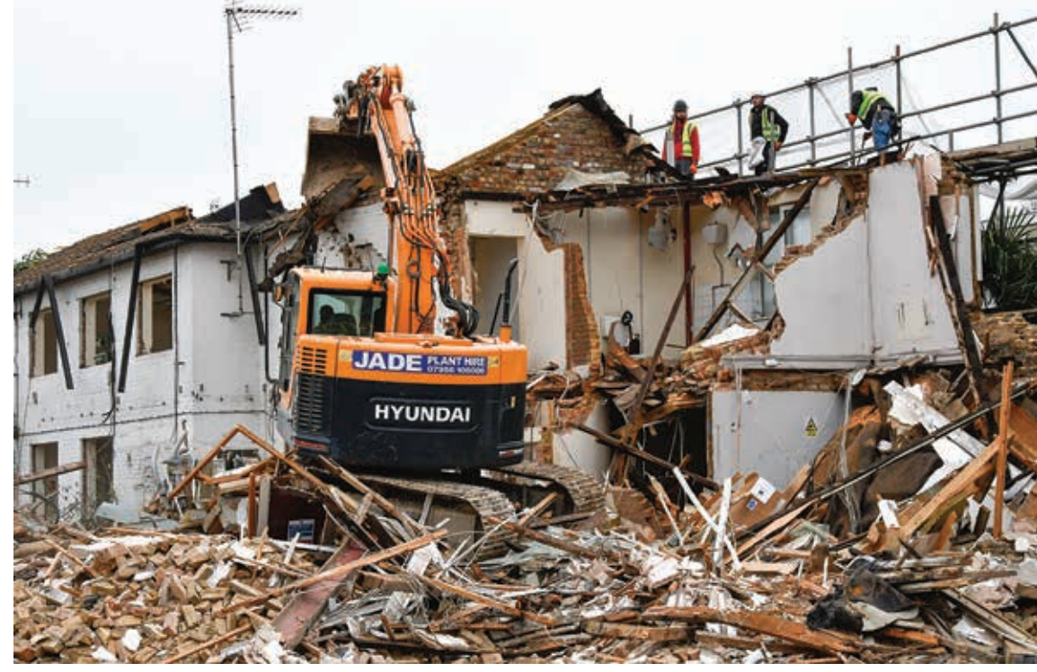
Bring the house down: Valona House being demolished last month.