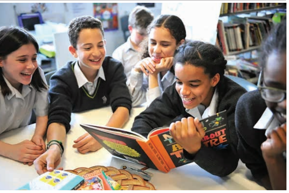
Joy of reading: The Archer Academy is launching a book-buying appeal.