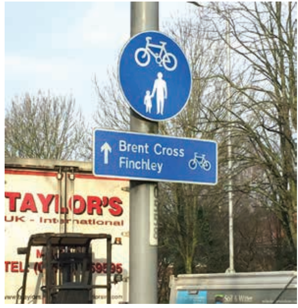
Safe passage: There is a shared cycle and pedestrian path alongside the A I

Turn back towards home here and continue