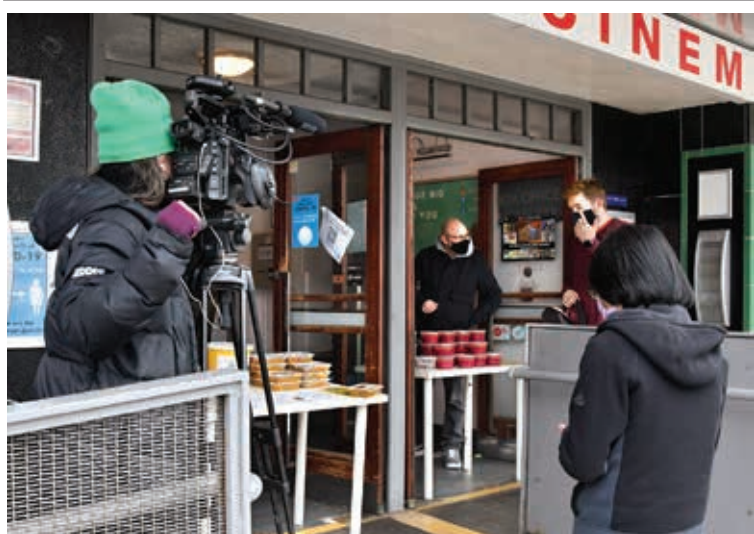
Food project volunteers being filmed by RTHK for the UK segment of their documentary 'Beyond the Pandemic'.