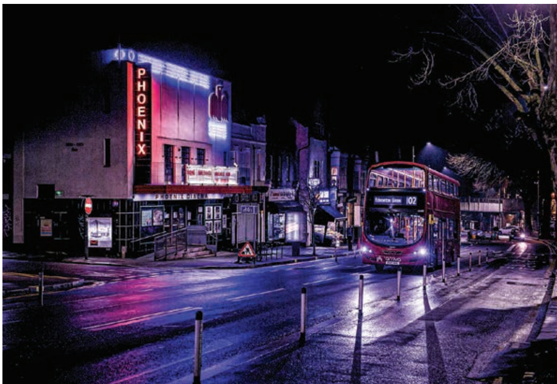
Bright lights: The Phoenix Cinema and the High Road by night.