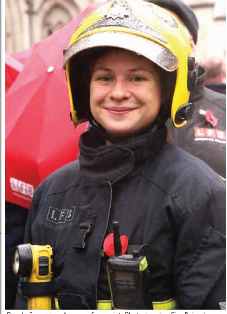
Ready for action: A young fire cadet.

The incident in The Causeway occurred less than six months after a teenage girl was subjected to a serious sexual assault by a group of boys in exactly the same spot and has led to calls from residents for CCTV cameras to be installed.