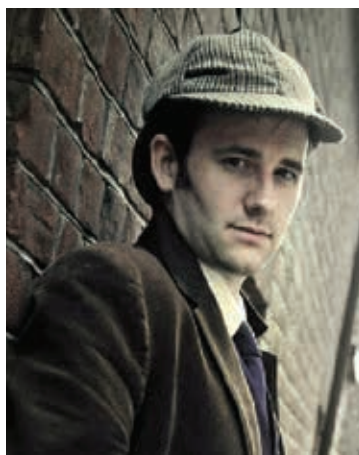
Off the wall: Pantaloon's Sherlock

Yes, everyone did keep their distance but, just for once, the pandemic wasn't centre stage.