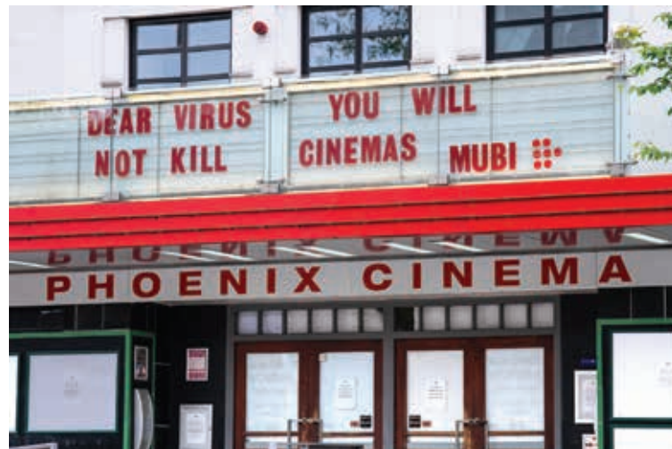
Defiant message: The Phoenix Cinema last month.

Financially, the Phoenix has been struggling against fall-