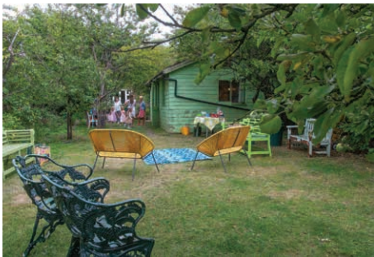
Retreat: Nicky Grace's garden in Tetherdown.

Nicky's Green Shed is now available again to hire for children's parties, craft workshops and courses. For more information visit: thegreenshedn10.com