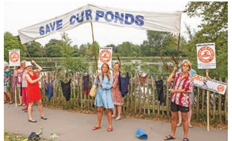
On the line: Protesters hang out swimming costumes and hold a banner to demonstrate against charges on Hampstead Heath.

So good luck to whoever is chosen to run the kiosk next. Whoever takes it on, though, is unlikely to see another season to match this one.