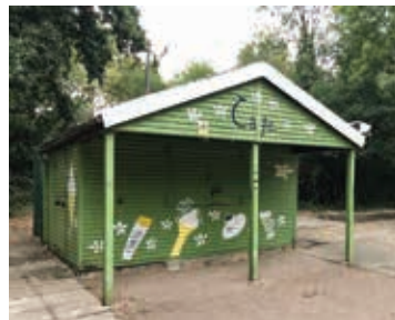
Vacant: Cherry Tree Wood kiosk

Its third lessee, Pepe, hoped to extend the café to make it into an all year round facility.