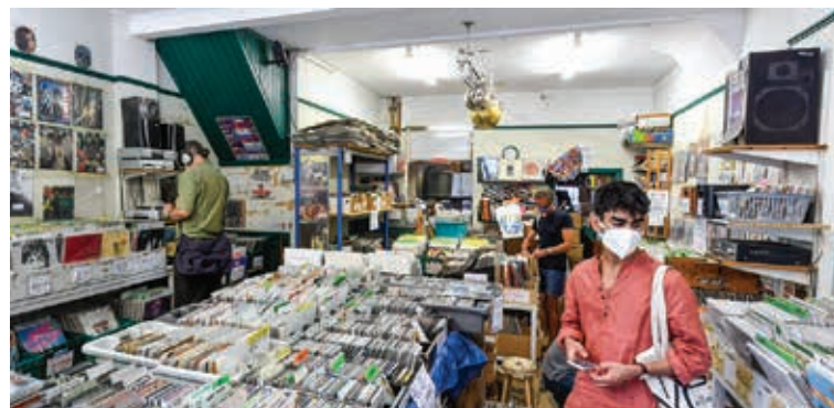
Browse and buy: Customers in Alan's Records.

appreciating music more when a disaster like the pandemic strikes. "A friend of mine in the music industry told me people bought music during the lockdown more than ever."