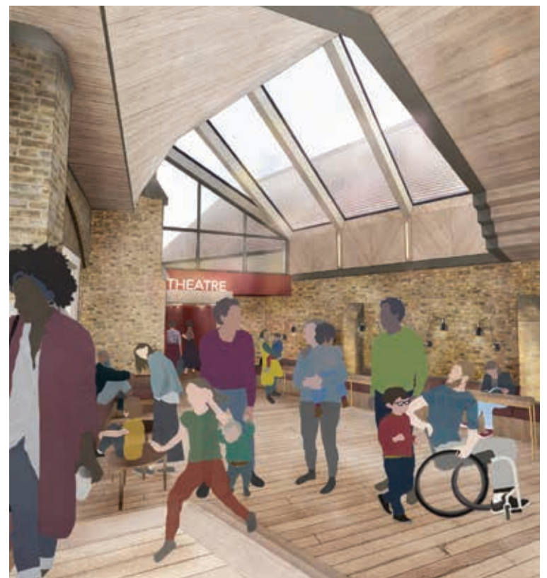
Vibrant venue: How the Jacksons Lane foyer and café space could look next summer

I must go down to the sea again, I'm at the end of my lockdown tether. I've got to go down to the sea again in this glorious summer weather! If crowds of people feel the same as me, I can only pray that they're virus-free, So that I'm safe as along the beach I roam, and can enjoy a cream tea before I go home.