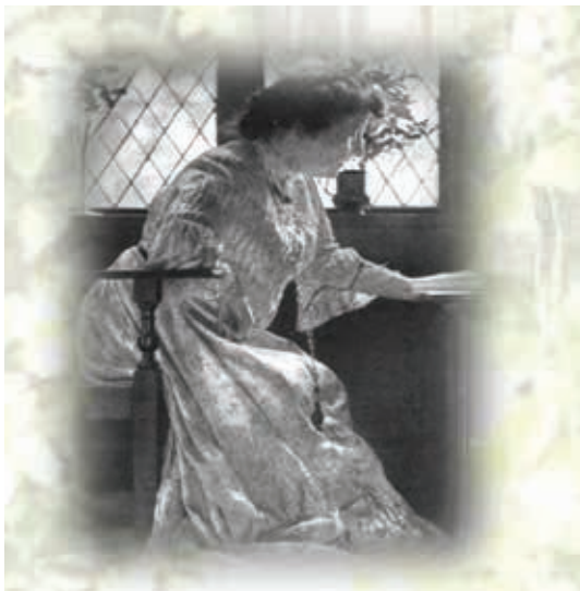
Popular author: Frances Hodgson Burnett