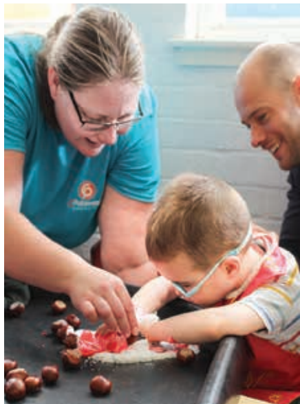
Play time: A youngster learns new skills at CPotential

Every year 1,800 children are diagnosed with cerebral palsy in the UK. It is the most common physical disability in childhood affecting movement and sensory development such as the ability to walk, talk or eat. Local charities are encouraged to visit www.morrisonsfoundation.com to find out how to apply for a grant.