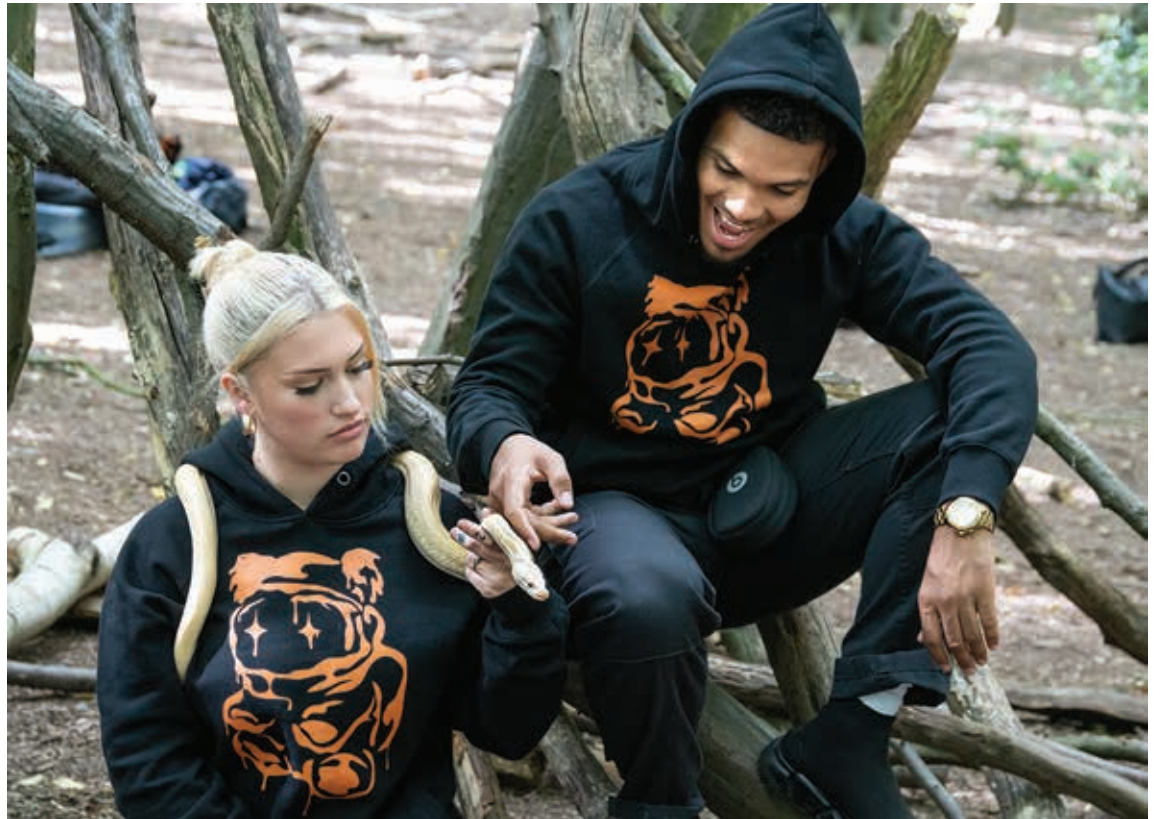
Matey python: Fashion models and their reptile friend in Coldfall Wood.

read, and discuss the state of the arts in the UK. It was a truly beautiful experience for me and I hope it sparked some positive connections for members of my community."