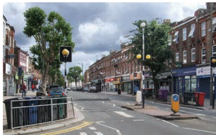
Heading south: The obscured and badly marked crossing.

Not only that but the presence of a double bus stop, just before the crossing, means that the white zig zag road markings are a shorter strip than usual. On the crossing itself, there's only one white stripe