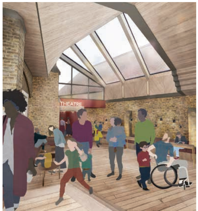
Vibrant venue: How the Jacksons Lane foyer and café space could look next summer

I must go down to the sea again, I'm at the end of my lockdown tether. I've got to go down to the sea again in this glorious summer weather! If crowds of people feel the same as me, I can only pray that they're virus-free, So that I'm safe as along the beach I roam, and can enjoy a cream tea before I go home.