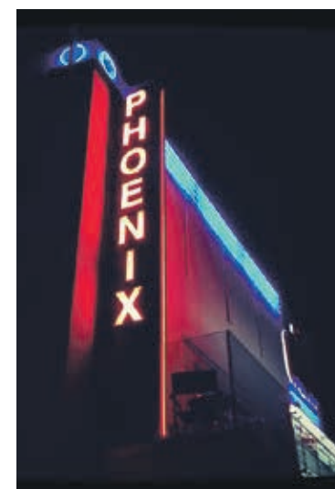
Lighting up again: Phoenix

government and will postpone their restart date if they have to. They advise filmgoers to keep checking the front of the cinema and the website for the latest information.