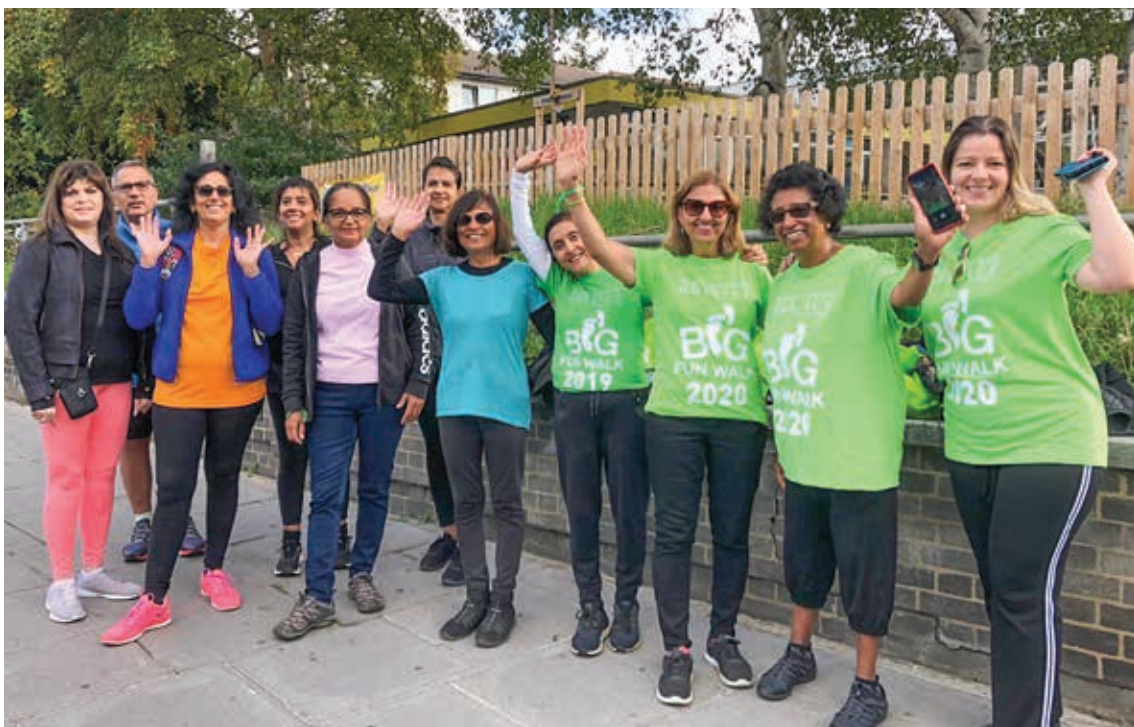
Big Fun Walkers about to set off from East Finchley

A community newspaper for East Finchley run entirely by volunteers.