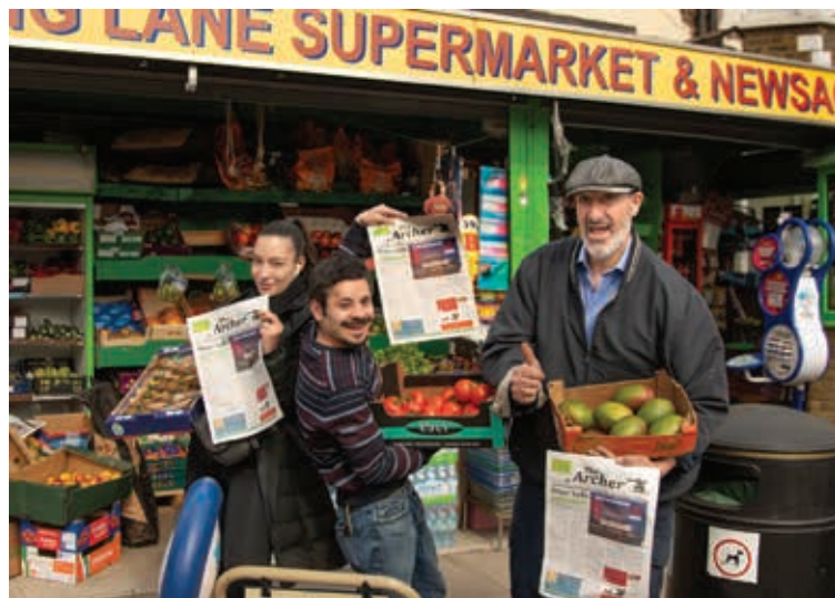
Hot off the press: The Long Lane Supermarket team are among those stocking The Archer .

Thank you to all the shops around East Finchley who have kindly stocked The Archer for people to pick up for free while our regular deliverers are temporarily confined to barracks.