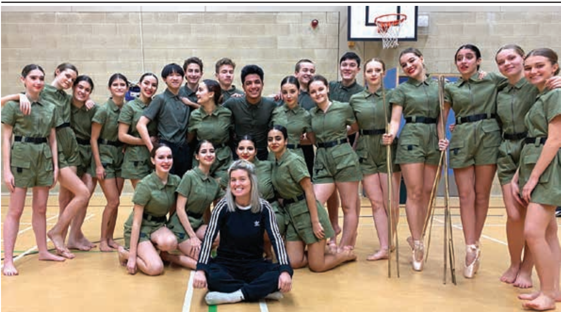
Wow factor: The Archer Academy dance team who impressed the Barnet judges.

Their victory means they are now one of the best four schools in the country and will compete for the national title in Hinckley, Leicestershire, on Saturday 14 March. Good luck, Fortismere!