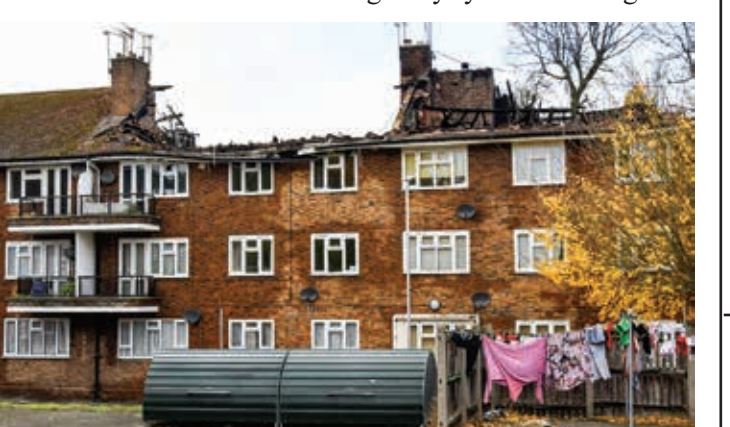
Damaged by fire: Willow House in July 2019

"We have kept in communication with tenants and leaseholders via regular hand-delivered letters regarding specific information," said the Barnet Homes spokesperson. "Our contact details are published in all fire safety communication, so we encourage residents to get in touch with us directly if they have any concerns." They added that they'd fixed the broken intercom within their repair timelines and that the block is checked regularly by the caretaking team.