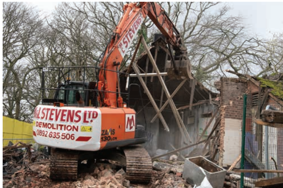
Torn down: The roof and walls of the pavilion are reduced to piles of brick and timber.