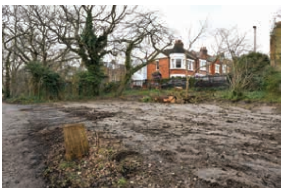
Back to earth: The former pavilion site is now bare soil.

no funding in place for anything to be located in place of the pavilion. The area will be cleared and then treated with top soil and grass seed."