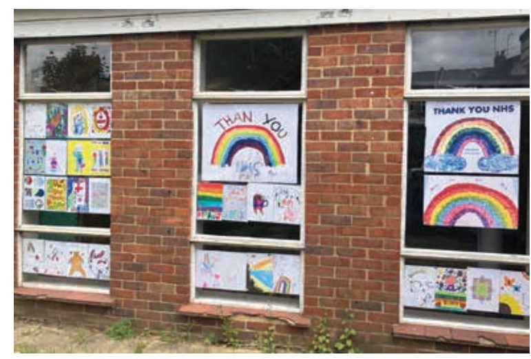
Window dressing: Rainbow images adom the Muswell Hill food bank.

Open Monday, Wednesday and Friday from 6pm-8pm and on Sunday from 6pm-9pm, the freephone number is 08088 02 00 80 (calls do not appear on itemised bills). Texts to 07860 058 793 will be responded to in the same hours and there is a webchat at www.rethink.org/ncl-suicide.