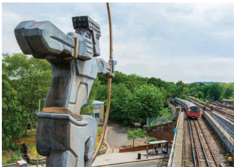
Icon: Archie in position at the station.

It is said that a golden arrow from Archie's bow was placed in Morden station, 17 miles away at the other end of the