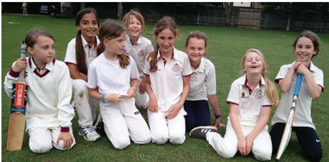
Summer ahead: The North Middlesex Cricket Club Under 11 girls.

appeared in the international journal Archives of Disease in Childhood . With comparisons often being made between homeopathic and man-made products, the researchers hope they have been able to show pupils that there is a link between natural remedies and the development of new drugs, as well as perhaps guiding them towards more healthy eating habits.