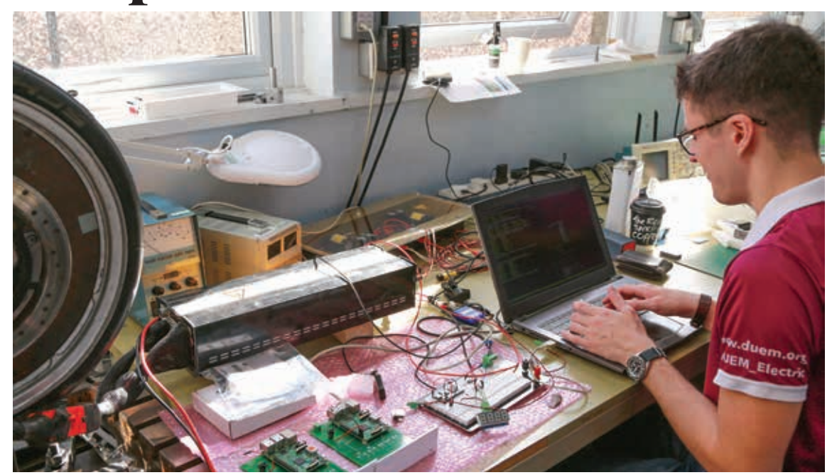
Running repairs: Isaac Rudden tweaks the car's electronic system on site in Australia.