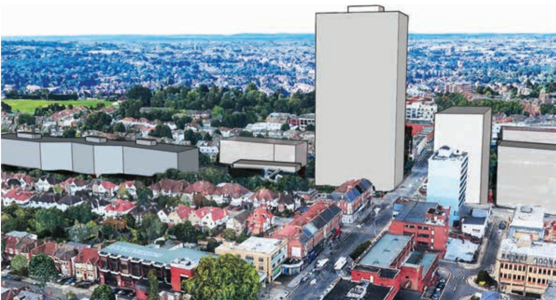
Towering: An artist's impression of how the Finchley Central development could look.

Age UK Barnet 020 8203 5040 Independent Age 0800 319 6789 Age UK 0800 169 2081