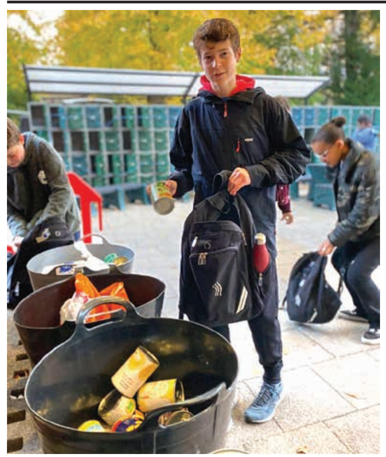
Pile 'em high: Students bring their food donations along on the Community Day.