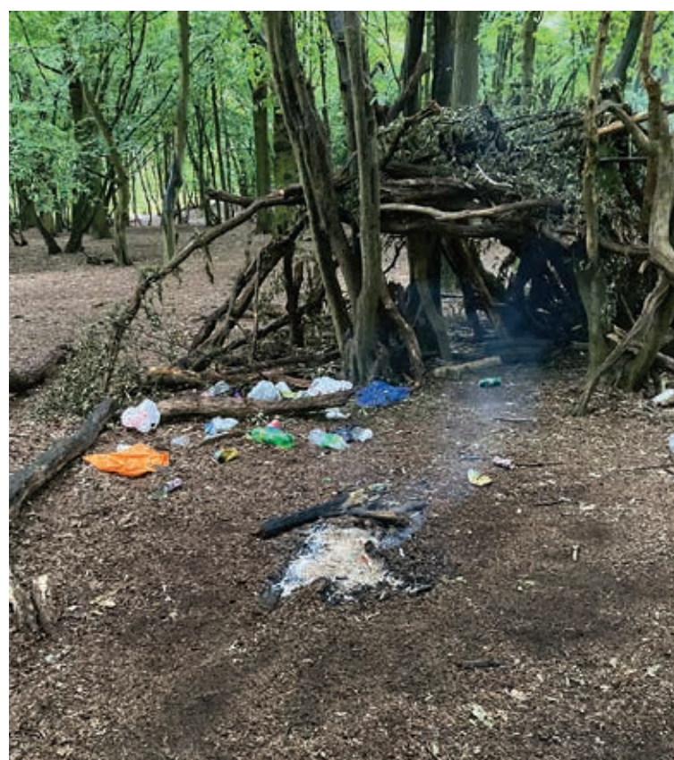
Morning after: Litter and a smoking fire in Coldfall Wood.

By late June Coldfall was very dry so several bright