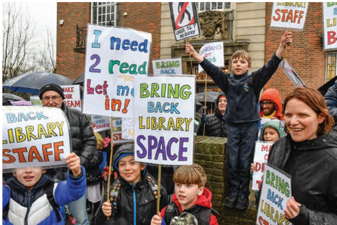
Need to read: Children and parents demonstrate in the rain outside East Finchley library.

It found that greater investment was needed in design and signage, and that some branches