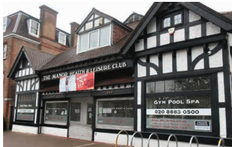
Temporarily out of action: The Manor Health Club

"As you will be aware we had to take the decision to temporarily close the club following electrical problems and release of hazardous fumes. This was caused by works external from the club undertaken by outside contractors not connected to us. "We are taking steps to make sure we can reopen as soon as possible but this must only be when it is safe to do so. We will update you as soon as we can and hope that this is resolved soon.