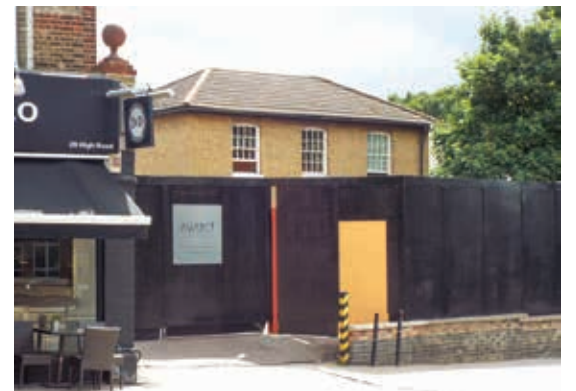
East Finchley's oldest building, Valona House

If you or any one you know has memories and/or photos of these events and their celebrations which you would like to share with our readers, please email them by Friday 10 April to news@the-archer.co.uk or write to us at The Archer , PO Box 3699, London N2 2DE. Thank you.