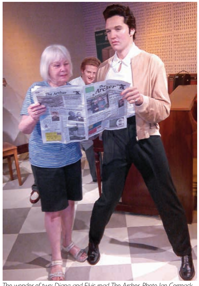
The wonder of two: Diana and Elvis read The Archer.