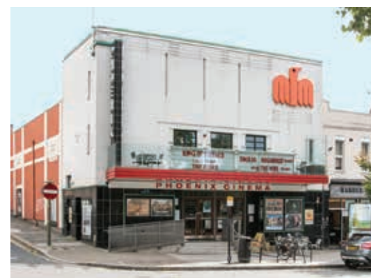
Second screen: The Phoenix is starting to plan

The Phoenix has come through the traditionally quiet summer period thanks to audience hits like the music documentary Pavarotti and