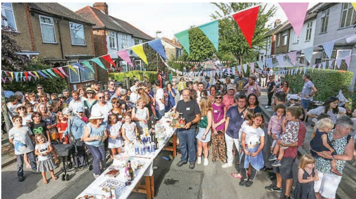
All together now: Leopold Road residents were out to celebrate.