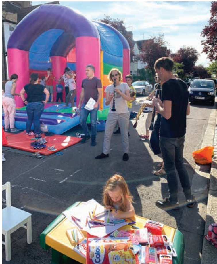
Jumping, jamming and colouring: The Chandos Road party in full swing.