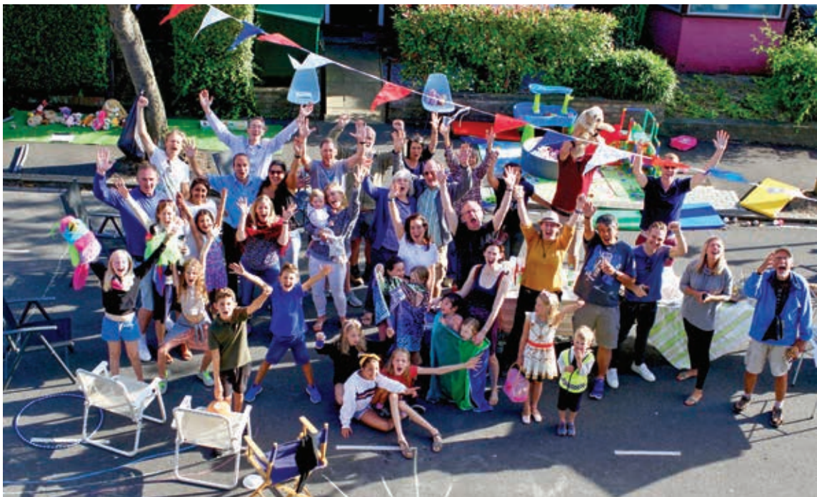
Give us a wave: Neighbours having fun at the Cherry Tree Road party.