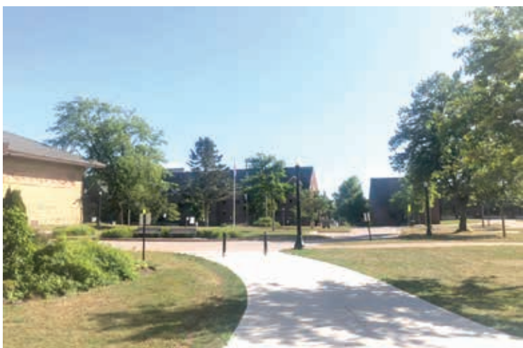
Campus: Mount Allison University in New Brunswick.

Finally, everyone in this university has been accommodating, and here I'm not saying Kent was not helpful, but I can see a notable difference. It could be a Canadian thing, so who knows!