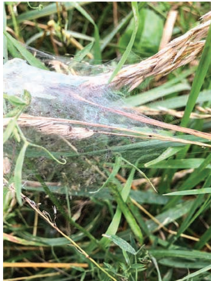
On the web: This intricate construction was spotted at Long Lane Pasture.

Do you get your blackberries from supermarkets? In the summer you can get the tastiest, juiciest and sweetest blackberries in Long Lane Pasture for free (but you can give a small donation). You can also volunteer to help at Long Lane Pasture. Young people can help with jobs like seed collecting, and surveying the wildlife, including in their various ponds. I hope to see lots of you there. So come along and decide for yourself what you think. Find out more at www.longlanepasture.org