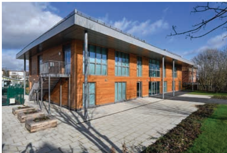
Signs of opening: The Tarling Road Community Centre.

The latest update from Barnet Council is that negotiations with City YMCA to manage the day-