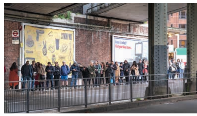
The queue for the 263 bus at East Finchley station.

In 2005, London Transport Users Committee identified the 263 as a problem route, particularly the 'solo stretch' between East and North Finchley. Recorded average waiting time was twice as long as it should be and, in just over one in 10 journeys surveyed, passengers