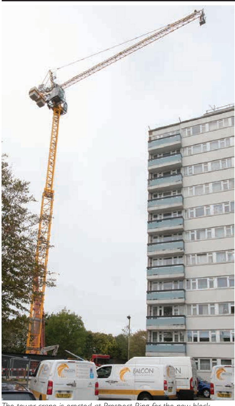
The tower crane is erected at Prospect Ring for the new block.