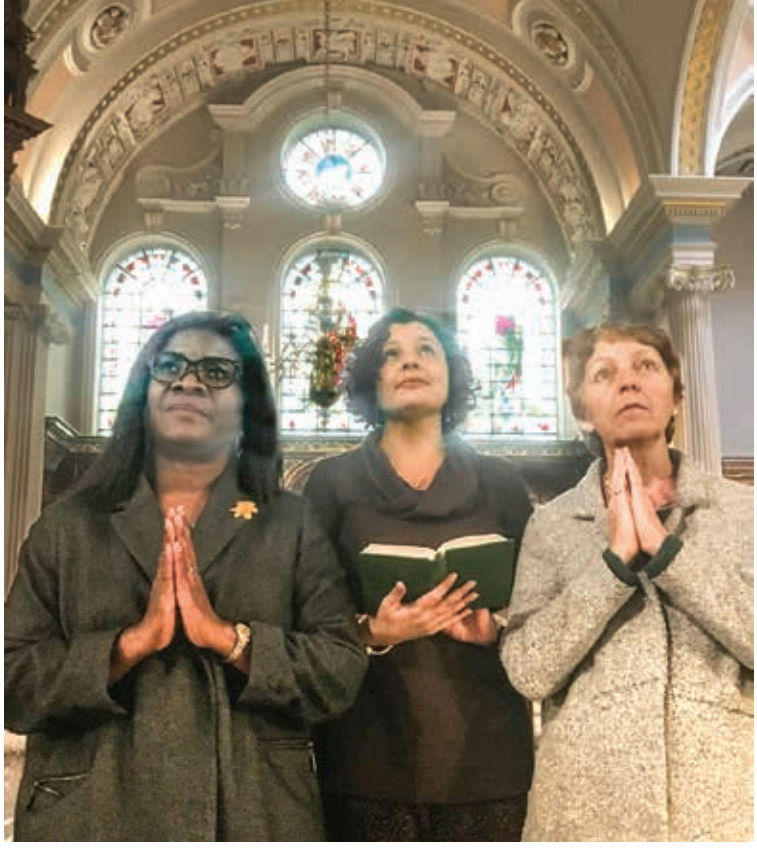
The Hampstead Players in rehearsal for The Sound of Music

Tickets are £12 standard adult, £10 concession, and £8 for a child. You can book online at hampsteadplayers.org.uk, or from the church on 020 7794 5808, or pay at the door. Parking is difficult in the immediate area, but Hampstead Tube station is very close, as are bus routes 46 and 268.