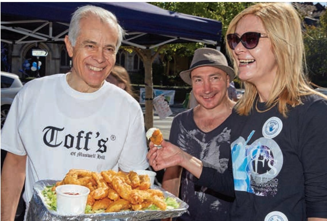
Free samples: Visitors enjoy the tastes of Muswell Hill Traders Week.