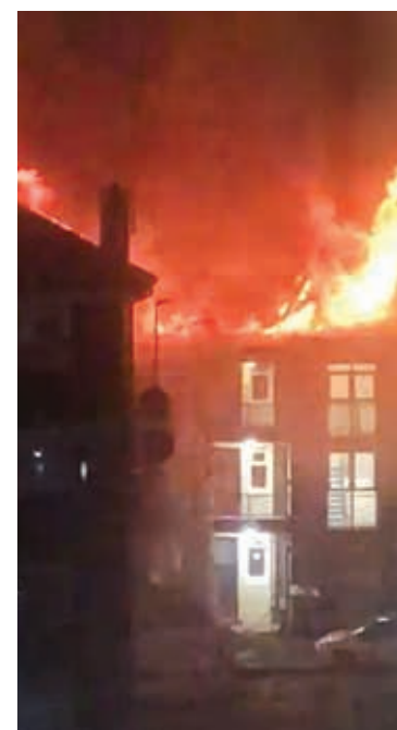
The Willow House blaze in 2018.

The block of flats, alongside the High Road, N2, is still covered in scaffolding and surrounded by a security fence. Residents say the main front door is broken and they feel intimidated by groups of young men who congregate behind the building smoking cannabis. We contacted Barnet Homes to see what was happening. They said that no one affected by the fire had been able to move back in as "the safety of our residents is our highest priority" and that although there had been "unforeseen delays", work on refurbishing the block will hopefully now start this month and be finished by next March.