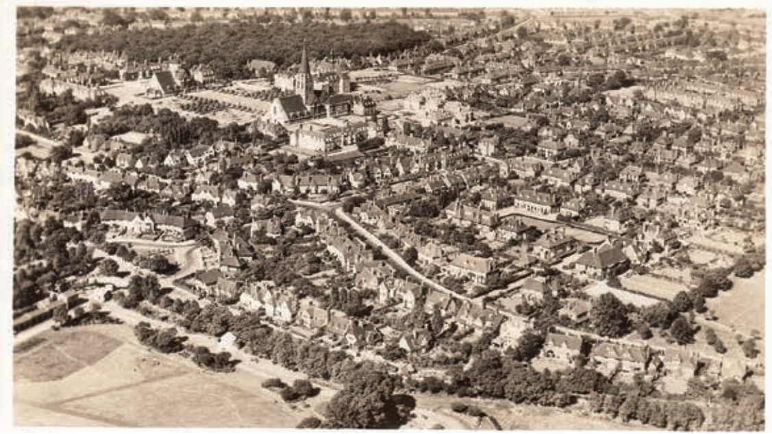
Model village: An aerial view of Hampstead Garden Suburb showing the planned street layout with St Jude's Church in the heart of the community.