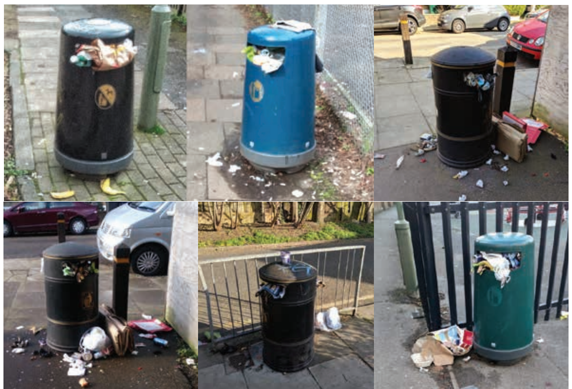
Overflowing bins