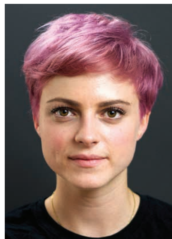
Eye contact: Two of Ivan Berg's portraits on show in Hampstead Garden Suburb.