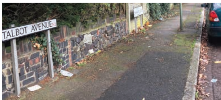
Left to rot: Litter and leaves clog Talbot Avenue, N2.

A Barnet Council spokesperson said the council remained