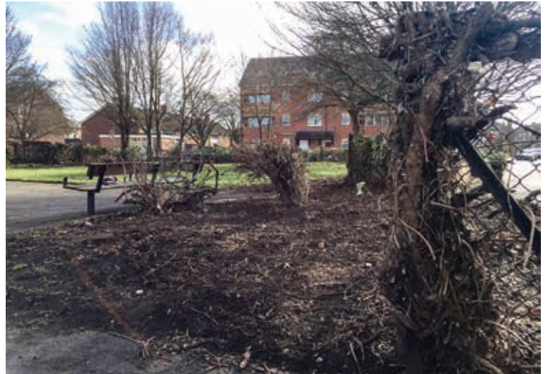
Cut backs: Shrubs and bushes at the playground have been sliced to ground level.