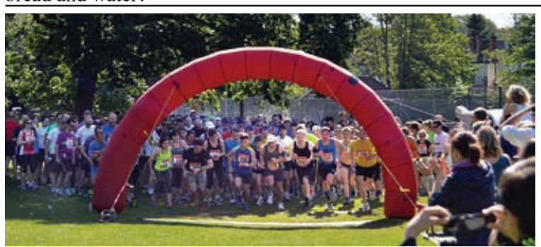
Run for it: Amateur athletes set off at the start of Race the Neighbours in Cherry Tree Wood last vear.