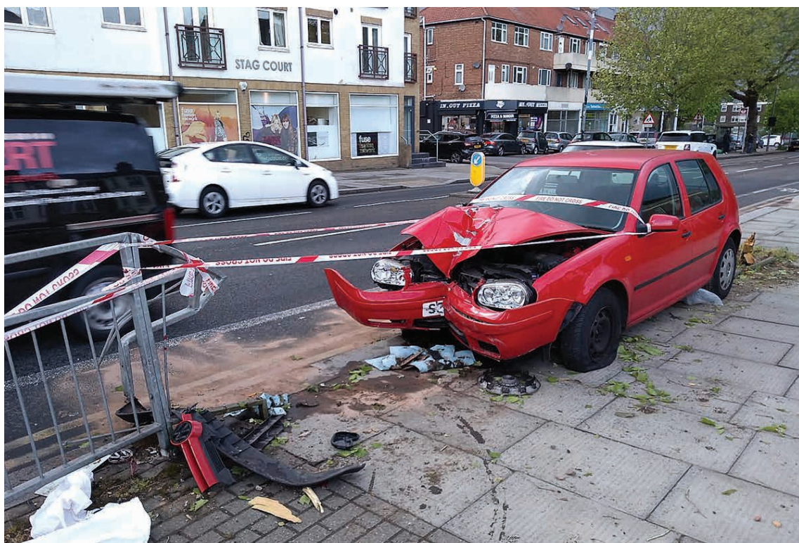
Hard impact: The badly damaged car at rest on the pavement in the High Road after ploughing through a young tree and into a guard rail.