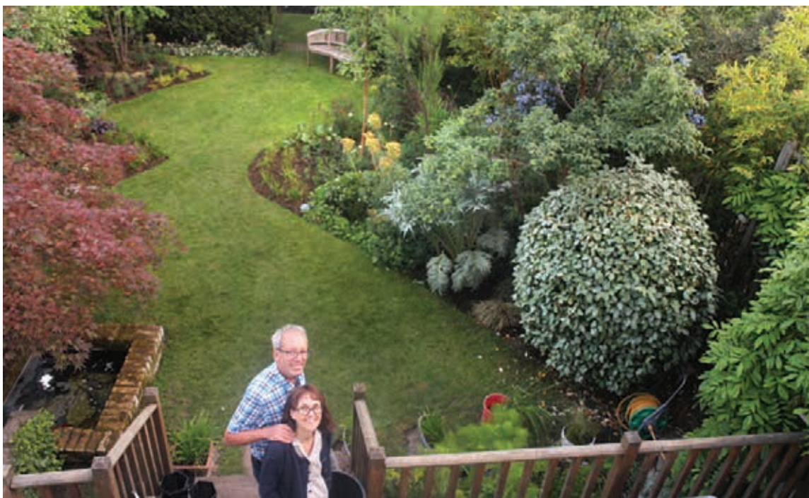
Bird's eye view: Stephen and Ruth just before opening their garden.