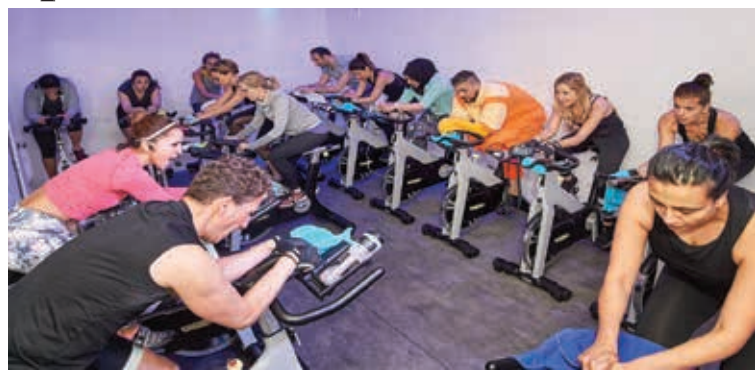
Wheely tough: Members of Spin Cyclub during their marathon session.

A 45-minute indoor cycling class is tough