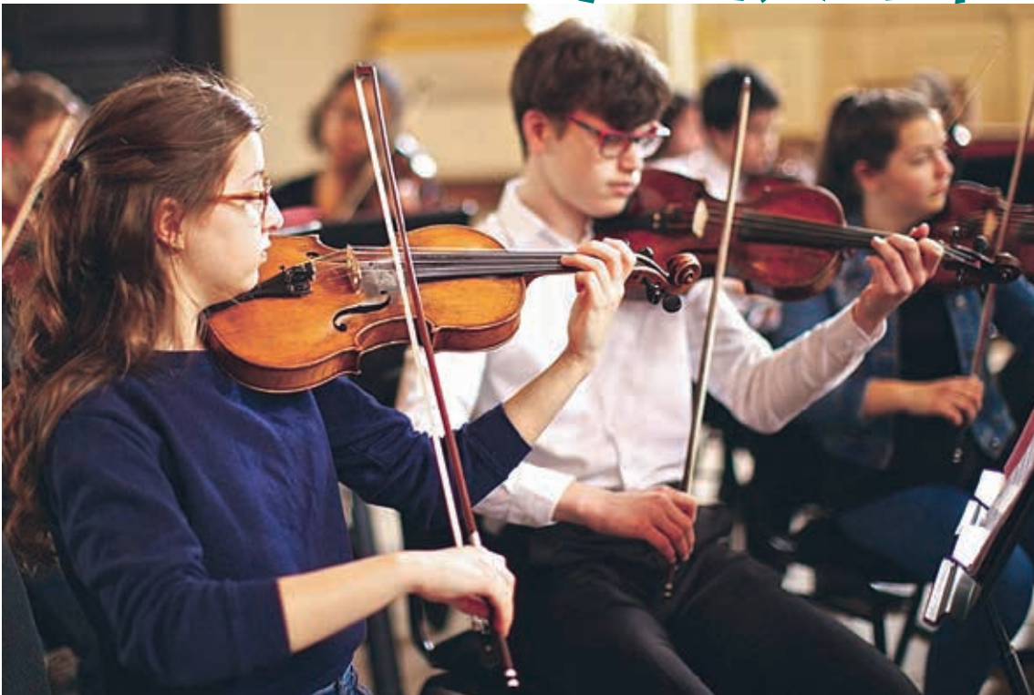
Orchestral manoeuvres: Young players at the Youth Music Centre.