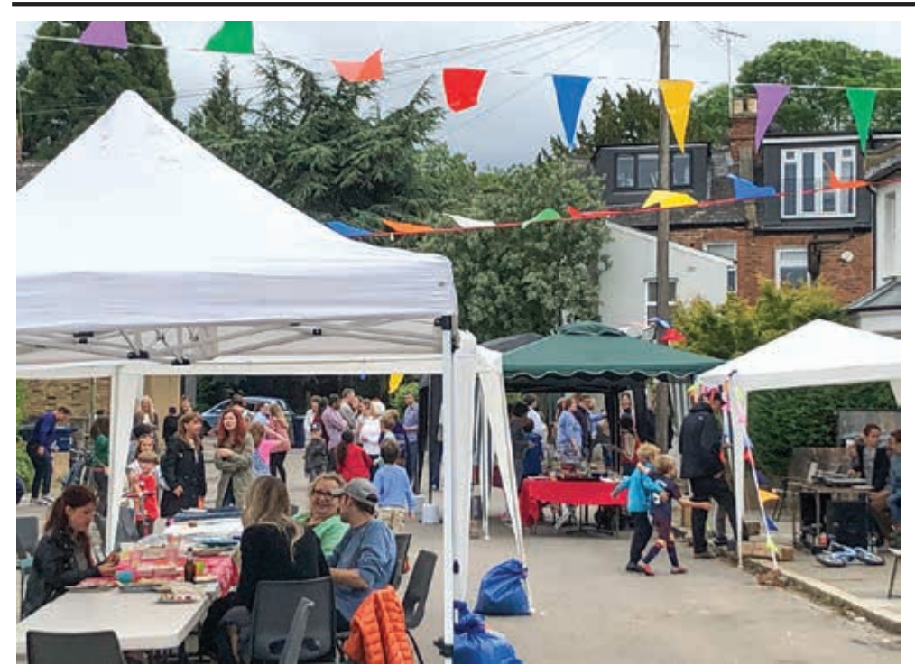
Pleasant tents: Neighbours relax together at the Manor Park Road party.