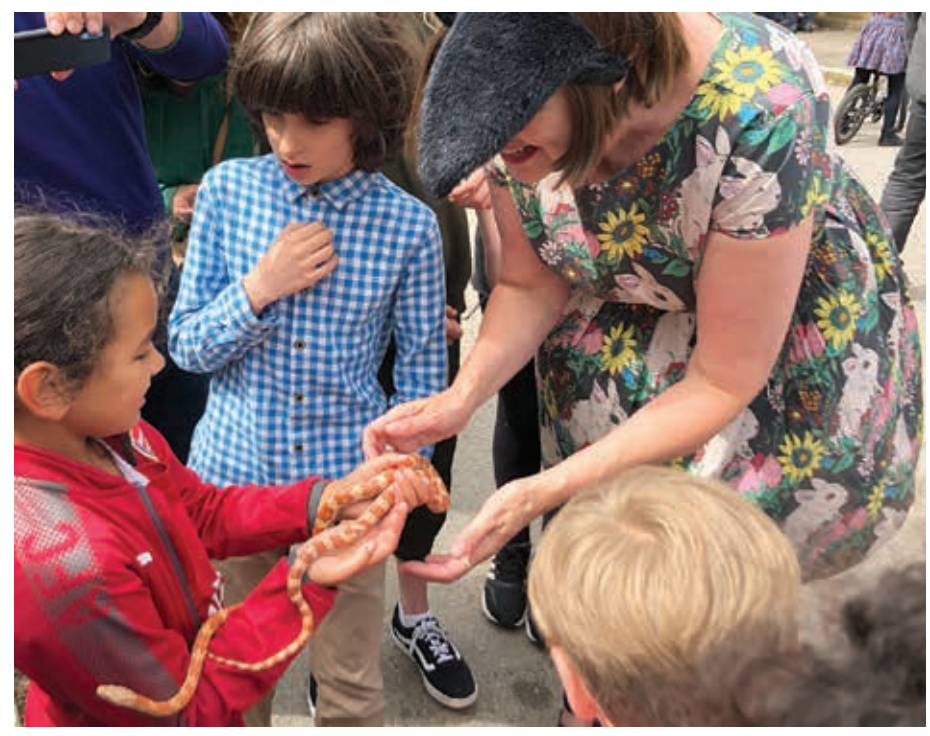
Hand snake: Mushu the snake makes friends in Manor Park Road.