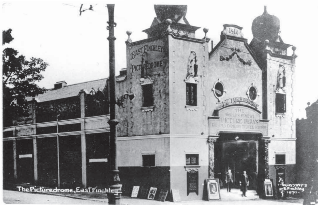
Palace of delights: How the Phoenix first looked in 1910, when the screen was at the High Road end